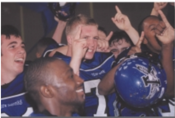
Apopka residents are very proud that the Apopka High Blue Darters won the state football championship in 2001 (Class 6A).

Apopka area schools also offer Magnet Programs , allowing students the opportunity for intensive study in specific, targeted areas. In Apopka, the following magnet programs are currently available: